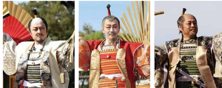
The photos are from last year's parade.

There will be troops led by Oda Nobunaga, who paved the way to unifying Japan. Toyotomi Hideyoshi, who was born in Owari region and ruled the entire country, and finally Tokugawa Ieyasu, who laid the foundation for the 300 years of prosperity of the Tokugawa Shogunate, will finish the procession.